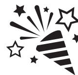
festivals and holidays